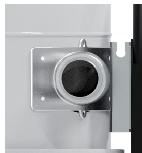
Models with tangential inlet