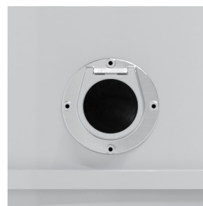
Models with central inlet