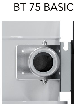
Models with tangential inlet