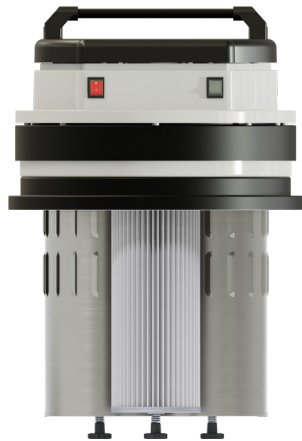
◀ Motorhead with automatic cleaning system ICLEAN