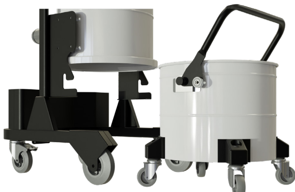
◀ Easy barrel release system